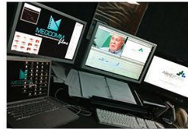
Editing Room A @ MEGCOMM